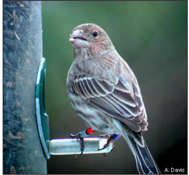
House Finch ( Carpodacus mexicanus )

Although house finch flocks cooperate to find food, competition for limited resources replaces cooperation once food is located. Socially dominant birds readily displace subordinate flockmates from feeders, creating a hierarchy of food access commonly referred to as a "pecking order". The aggressive interactions involved in this process are stressful: when Dr. Hawley manipulated the extent to which house finches had to fight to obtain food, birds living amongst heated competition had significantly compromised immune responses. Each individual's place in the hierarchy was equally important-- in most cases, dominant finches mounted the strongest immune responses,